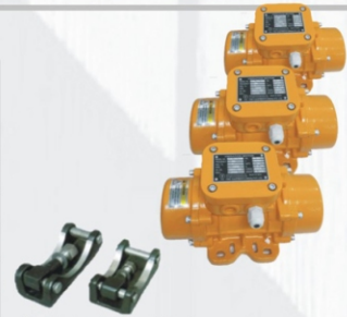
Cradle for Shutter Vibrator Code: FVCR 1516