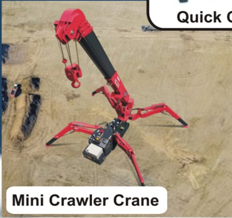
Mini Crawler Crane