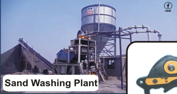
Sand Washing Plant